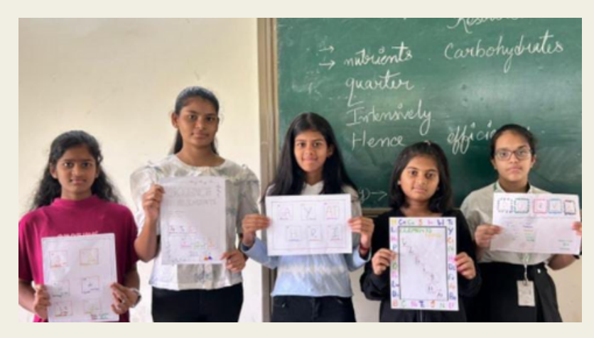
My name in Elements Class IX